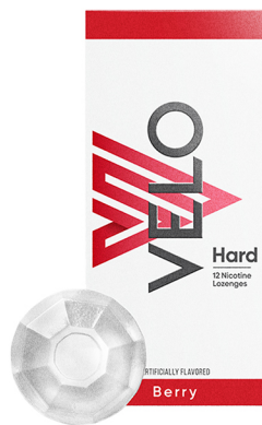
Tablets & Lozenges